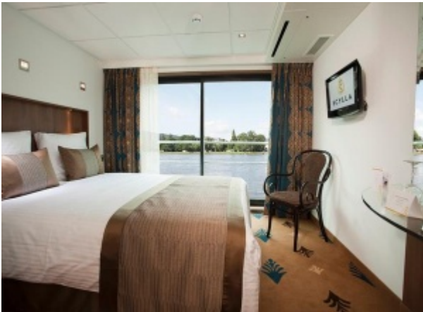
Doppelkabine / Double cabin