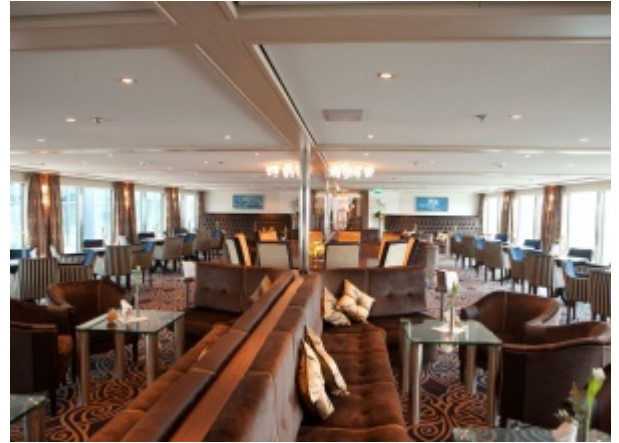
Salon / Lounge